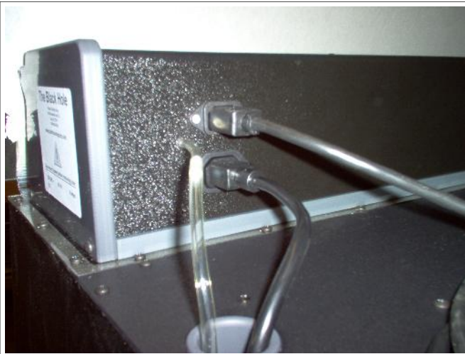
1) Electrical and vacuum attachments must be removed from top section.