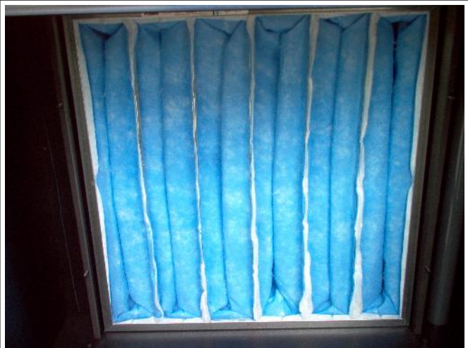
6) Remove primary filter.