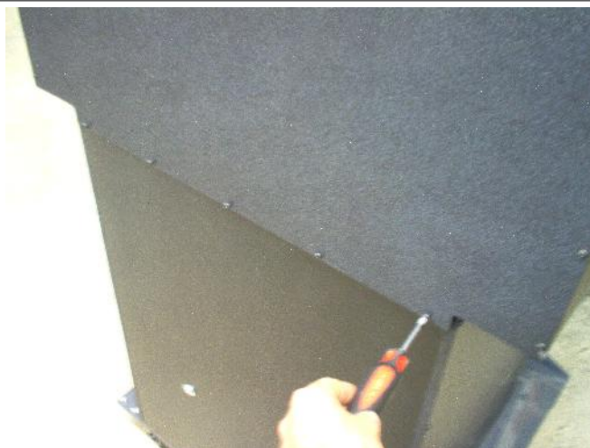
11) Remove screws on back. There are 5.