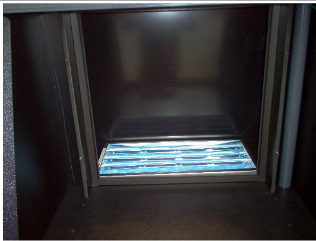
7) Remove secondary filter.