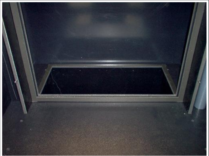
8) Remove final filter.