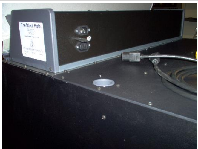
4) Top should look like this.