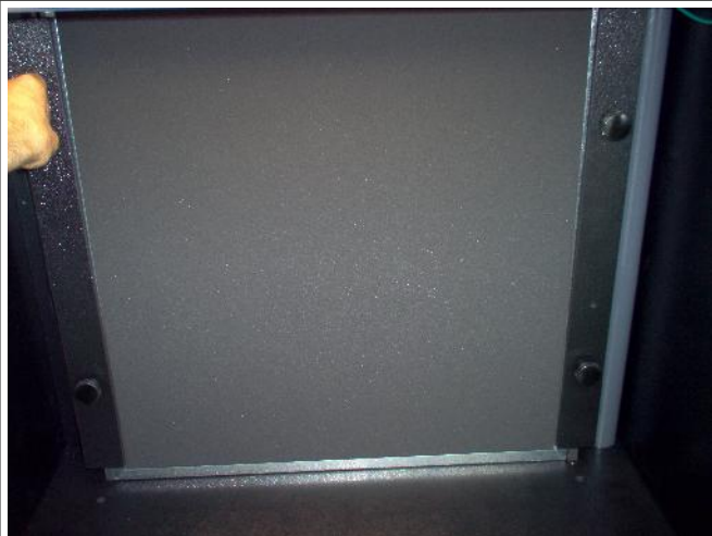
5) Remove filter clamp knobs. There are 4