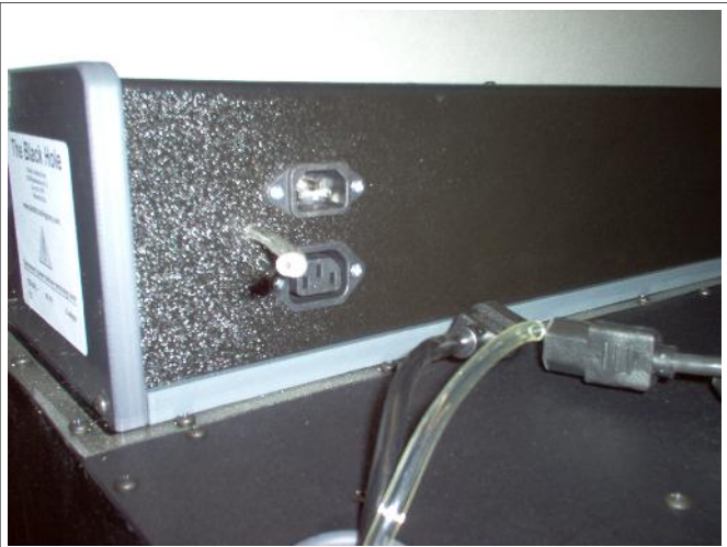
2) Pull plugs and vacuum tube.