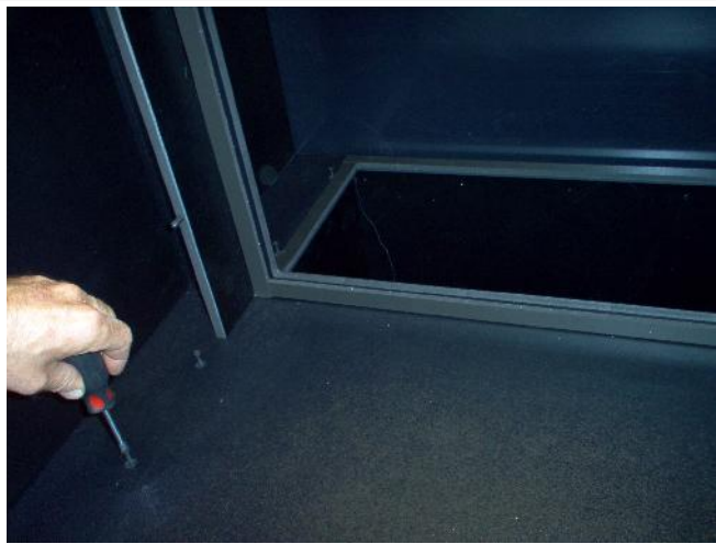
9) Remove screws on left side. There are 4 front to back