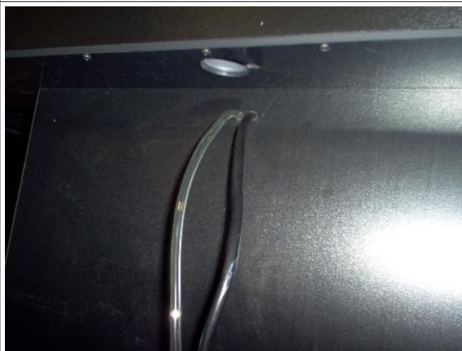
3) Pull lower cord and vacuum tube through lower end of conduit.